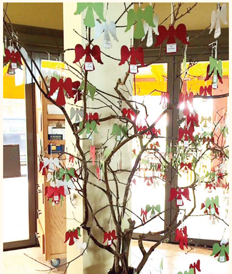
The Giving Tree is an opportunity for parishioners to give to those in our community who are less fortunate.