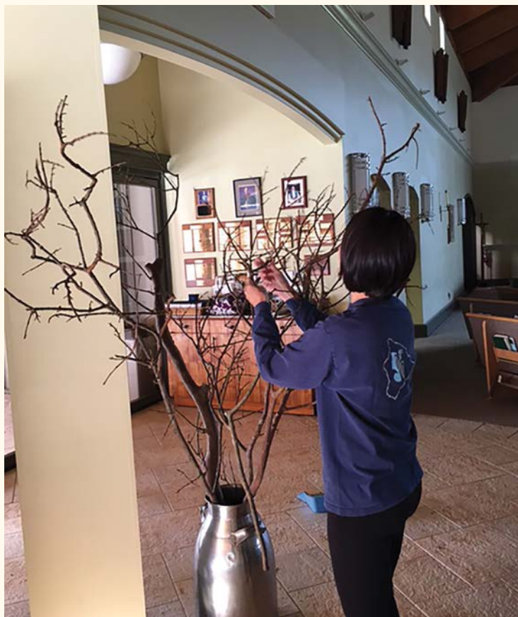
Remembering the true meaning of the season, parishioners are encouraged to participate in our annual Giving Tree.